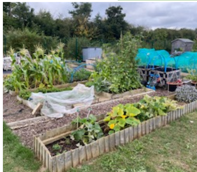
MARIUS ALLOTMENT = 1 VACANT PLOT