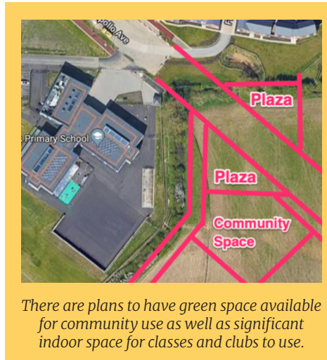
There are plans to have green space available for community use as well as significant indoor space for classes and clubs to use.